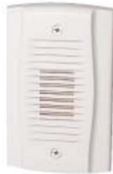
MHW UL 54011