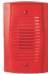
MHR UL 54011