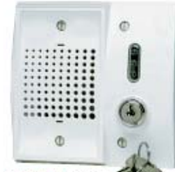
SSK451 UL 52522