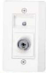
RTS451KEY UL 52522