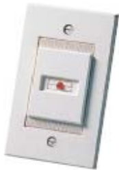
RA400Z UL 52522