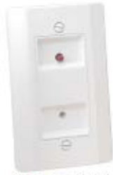
RTS451 UL 52522