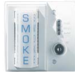
SSK451 with PS24LOW strobe and PS12/24 LENS W lens