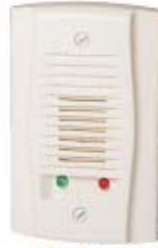
APA151 UL 54011